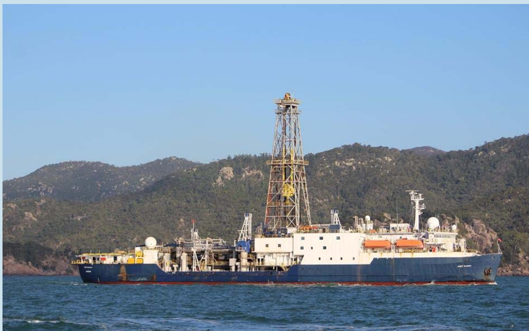
JOIDES Resolution leaving Townsville